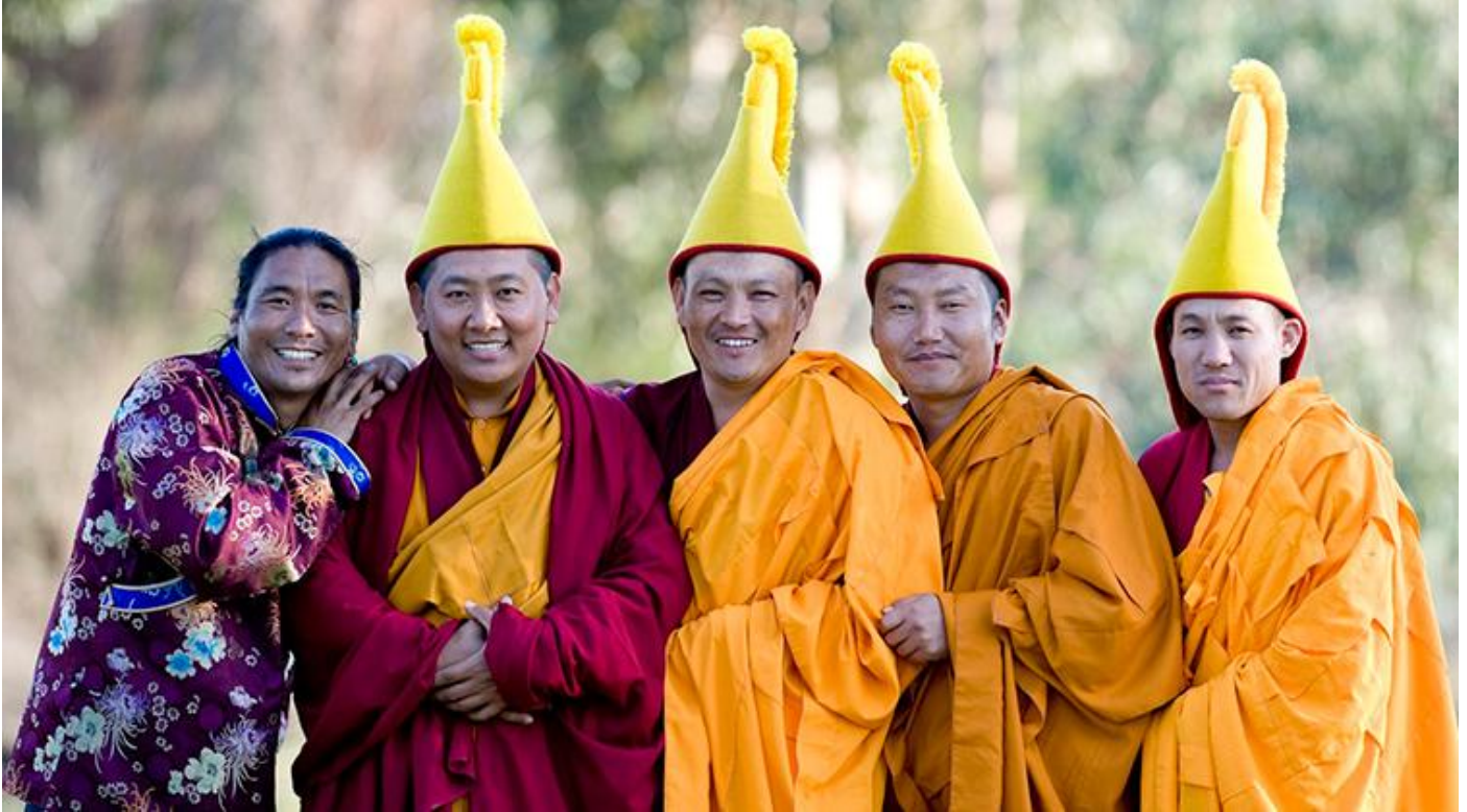
Tibetan Monks to perform at the 2015 Promenade of Sacred Music.

Tickets will go on sale early 2015 via Hamilton Performing Arts Centre. A Gold Pass provides access to all performances for $120 inc GST. The festival combines performances of fine music (traditional and contemporary, choral and instrumental) by both talented local and professional artists in the historic churches and unique venues in Hamilton and surrounding townships. The combination of professional and local performers, provide both local people and visitors to the region with the opportunity to enjoy high calibre, world class performances in beautiful and unique venues. It also provides a stage for the local amateur artists to perform with and learn from the professional artists invited to be part of the festival. Details soon at http://www.promenadeofsacredmusic.com.au/ The Grampians look forward to welcoming you to the 2015 Southern Grampians Promenade of Sacred Music.