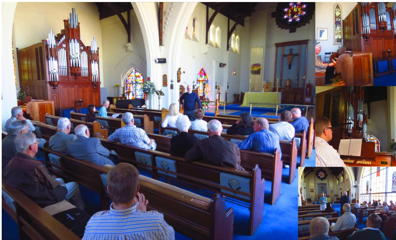
St Silas Anglican Church, Albert Park.

Images of the Melbourne Cup Day Organ Ramble and Annual General Meeting