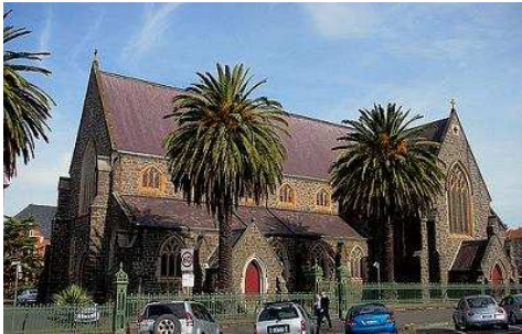
St Patrick's Cathedral

ORGANS OF THE BALLARAT GOLDFIELDS – Organ recital venues of 13-22 January.