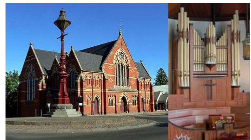
Lydiard Street Uniting Church