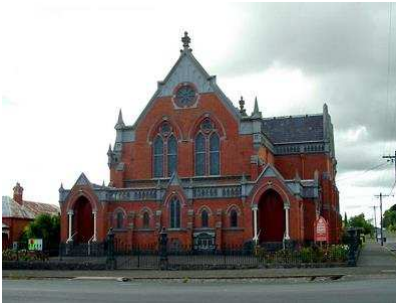
Neil Street Uniting Church