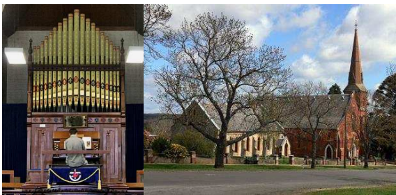
Daylesford Uniting Church